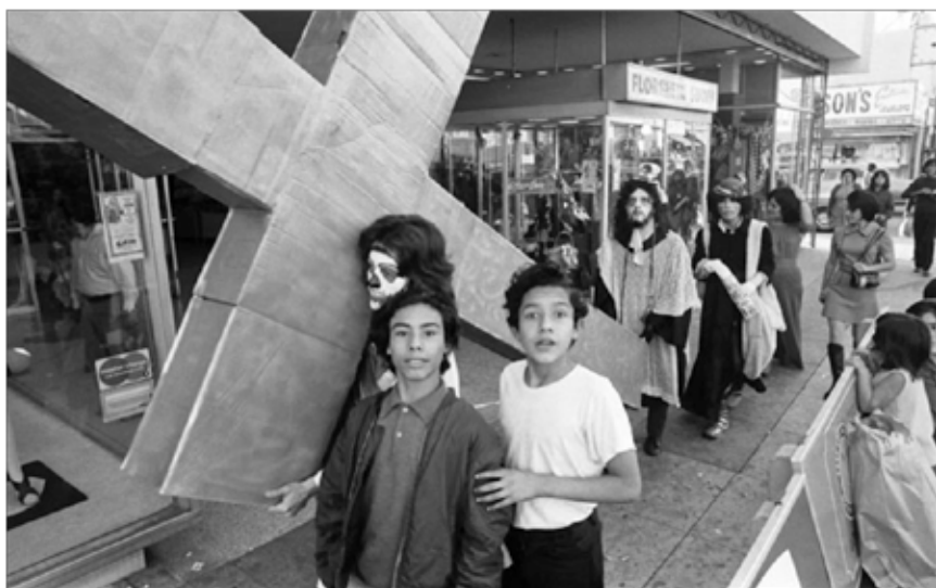
Seymour Rosen, Asco's Stations of the Cross , 1971, gelatin silver print (printed 2011), 18 x 24 in. (45.7 x 61 cm) (photograph © SPACES—Saving and Preserving Arts and Cultural Environments)

hostility? Are there misogynist or homophobic connotations? Why not just call us “niggas”? That would be too much, a transgression too far, and perhaps a less appropriate description of this audience. But have we come so far around that it's not too much for a onetime gangsta rapper and former avowed enemy of the LAPD, working on behalf of a conservative institution and under corporate advertising direction, to call the museum public a bitch to its face? Is this postmodern multiplicity, under which minority dialects are brought into equivalence with standard speech, where black colloquial talk is validated as one of many permissible languages that communicates with a decentralized apparatus? Or is this that postmodern assimilative force that renders all speech, all difference, all performativity meaningless under the auspices of spectacular dominance? Does this practice of equivalence, a deeply democratic notion, strengthen different voices, or finally order them into a more manageable and compliant public sphere?