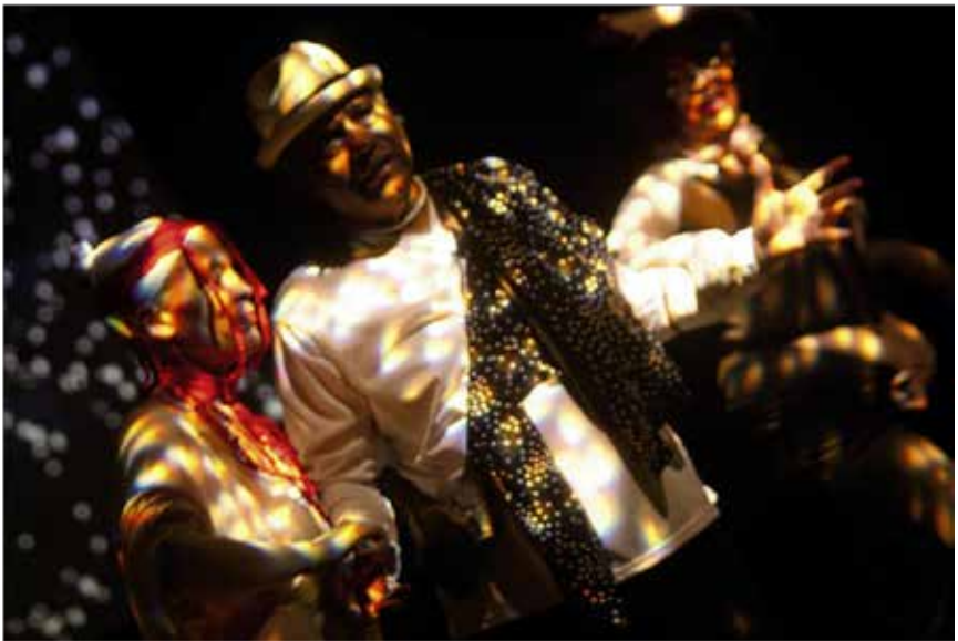
Maren Hassinger, Ulysses Jenkins , and Senga Nengudi, Kiss , 2011, Hammer Museum, Los Angeles, 2012 (artwork © Maren Hassinger, Ulysses Jenkins , and Senga Nengudi)

the way that viewers gather around the space and look in toward the lynching, replicating the positions and the gazes of the grotesque cast figures who watch from the periphery. For a moment, in one's own peripheral vision, one can confuse the presence of a museum visitor who is standing still with the presence of one of the sculpted culprits. The immersive environment, the theatrical lighting, the installation's various narrative suggestions, and the sense that these figures are posed mid-action—all enact a political drama that compels viewers to engage with the discursive terms of racial spectacle. The opposite of minimalist, Five Car Stud represents a specific cultural signifier at real scale, symbolizing a fundamental history of American racism.