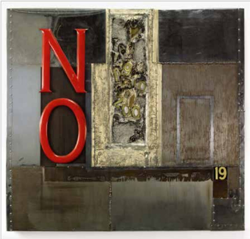
John Outterbridge, No Time for Jivin', from Containment Series, 1969, mixed media, 56 x 60 in. (142.2 x 152.4 cm). Mills College Art Museum, purchased with funds from the Susan L. Mills Fund (artwork © John Outterbridge)

Like Now Dig This! many of the current exhibitions illustrate apparently positive differences between now and then. Fascinatingly, PST's historicizing structure draws critical attention to the elided period, 1981–2010, when transformative debates around the politics of representation accompanied a reformation of the social sphere to acknowledge the interests of women, people of color, queers, and others. Identity politics influenced the art milieu. More broadly, a cultural assimilation of a diversity-tolerant form of liberal pluralism made different kinds of representations possible within powerful institutions during these years. Much remains unsaid