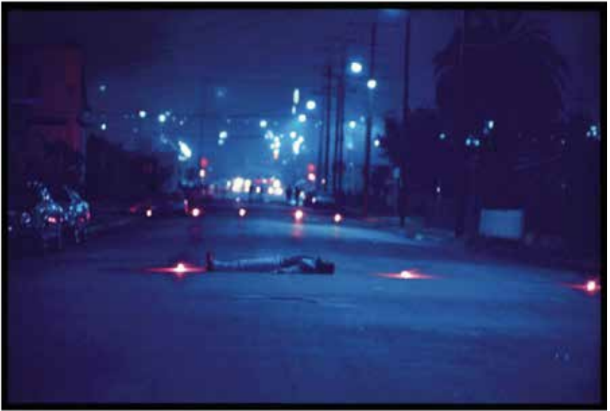
Asco, detail of Decoy Gang War Victim, 1974, color photograph, 16 x 20 in. (40.6 x 50.8 cm) (artwork © Asco; photograph © Harry Gamboa, Jr., provided by the photographer)

Instead, Valdez's photographed body personifies the racial, gender, and political differences that played out against the body of the museum in this action, a museum that had a poor history of showing women artists, people of color, or performance art, even. Now, with a carefully curated exhibition, a gloriously thorough 432-page catalogue, and demonstrations of public appreciation that extended to the cover of the New York-based Artforum magazine, Asco has been reoriented.[3. Artforum, October 2011, cover.] The Asco exhibition, which transforms provisional performances, videos, and ephemera into a legible museum display, reasserts the question that lingers around so many of these projects: is this a radicalization of the institution or an institutionalization of the radical? The answer to this question, here and elsewhere, is yes, both. That this question has more than one answer is already a signal that the singular force of the institution can be unsettled by ambivalent production. While such institutionalization softens the rough edges of margin-