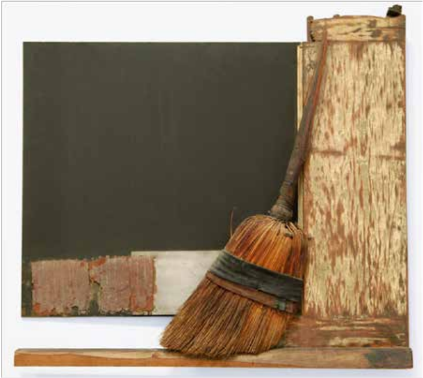
Dale Brockman Davis, Swept , 1970, mixed media, 30 x 40 x 6 in. (76.2 x 101.6 x 15.2 cm). Blocker Collection (artwork © Dale Brockman)

Gaines quotes the artist Adrian Piper in The Theater of Refusal , who points out conspiratorially: “I really think post-structuralism is a plot! It’s the perfect ideology to promote if you want to co-opt women and people of color and deny them access to the potent tolls of rationality and objectivity.” 11 As Piper indicates, just as marginalized people sought to validate their own subject positions, critical theory came around to dismantle the very subject status to which these others had attained. At the same time, identity-oriented artworks and exhibitions were entering mainstream institutions and markets during the 1980s and 1990s. The exhibition Gaines curated and his essay illustrated that among the black artists who had by then begun to be recognized,