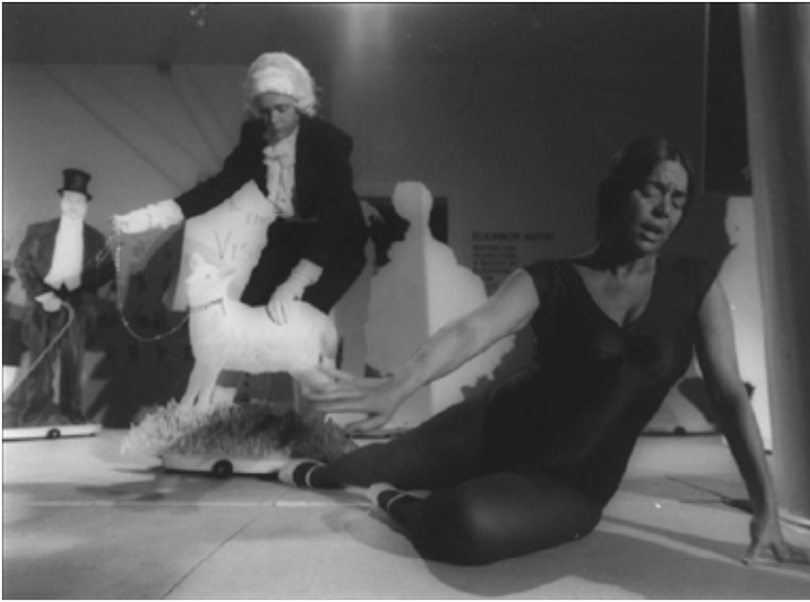
Eleanor Antin, Before the Revolution, 1979, Santa Barbara Museum of Art, 1979, performance. Foreground: the artist as Eleanora Antinova