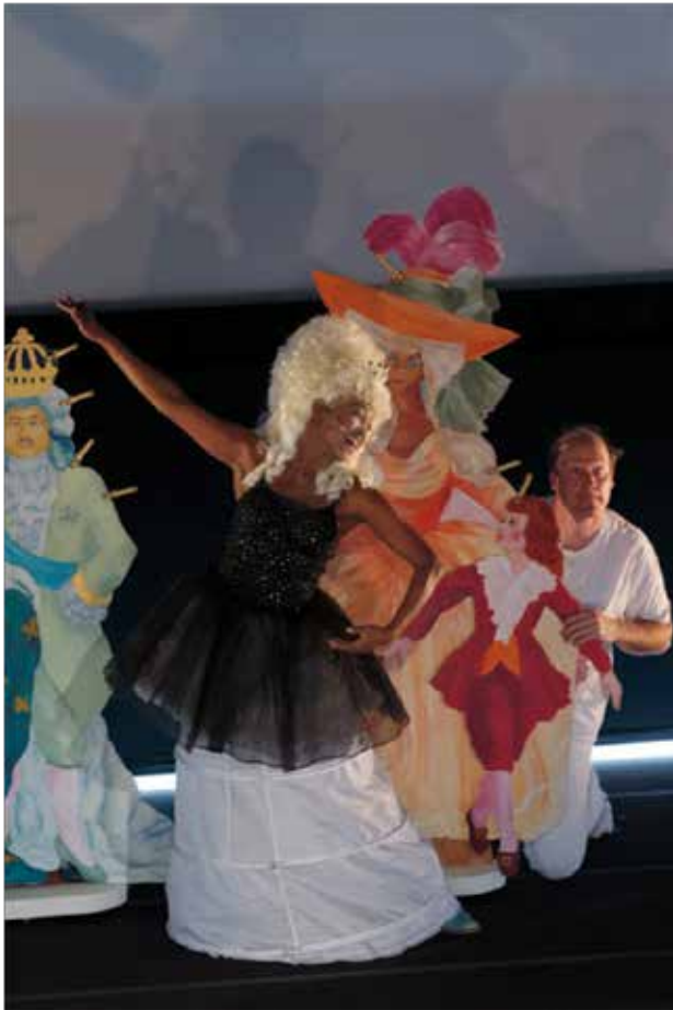
Eleanor Antin, Before the Revolution , 1979, performance, Hammer Museum, Los Angeles, 2012 (artwork © Eleanor Antin)

In his curator's note for the 2012 program, Segade explains: The character is quixotic and quizzical, a great dancer whose career is negatively impacted by the fact of her race in contrast to her nationality (black v. Russian), her over-determined relationship to gender (ballerina!), and her place in history (Classicism v. Modernism v. Post-). . . . This radical figure functions as a site for critique of the contradictory and constructed divisions among races, classes, careers, histories, and even artistic forms. 14