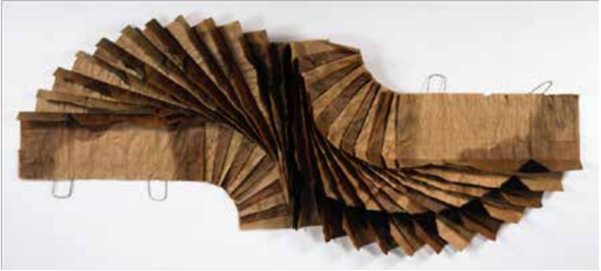
David Hammons, Bag Lady in Flight , ca. 1970, shopping bags, grease, and hair, 42-1/2 x 116-1/2 x 3-1/2 in. (108 x 295.9 x 8.9 cm). Collection Eileen Harris Norton, Santa Monica, California (artwork © David Hammons)

ing university galleries and the Watts Tower Art Center, few features remain from that period's landscape. LACMA did exist at its current, much-expanded site, and, as in the presentation of Five Car Stud and Asco: Elite of the Obscure, it subtly embodies the corrective spirit PST has engendered.